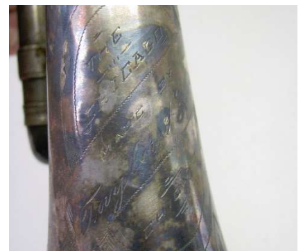
Photo 4, page 1, is T&H cornet #246 ( Horn-u-copia.net ); photos 5 & 6, page 1 and photo 1 this page are #701 ( Horntrader.com ); photos 2-4 this page are cornet #1401 labeled "The Chicago" (auction photos)

1922 Horn is music director for five area bands ( Jacob's , Dec).